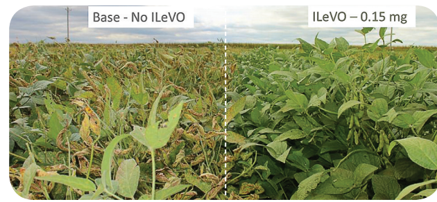
2014; ROLAND, IA