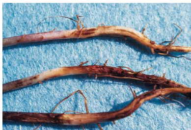
Figure 1. (Top) Pythium damping-off, (middle) Phytophthora infection, (bottom) Rhizoctonia infection.