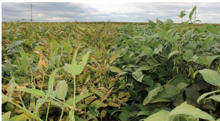
Figure 3. Control (left) showing SDS symptoms (treated with commercial seed-applied fungicides plus Poncho®/VOTIVO®) versus soybeans treated with ILeVO® Seed Treatment plus the control treatments (right).

Acceleron® Seed Applied Solutions products for soybeans can be paired with ILeVO® to help provide additional protection from sudden death syndrome (SDS) (Figure 3) and includes a biological mode of action for SCN, root-knot, and reniform nematodes. ILeVO can be used with SCN-resistant and other soybean products to manage nematodes in newly infested fields or fields with established infestations. ILeVO is the only seed treatment that provides early-season SDS control (both the root rot and foliar phases) and a true nematicide that kills nematodes in the seed zone.